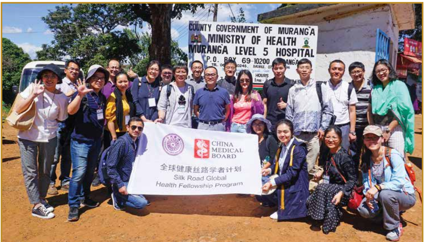
Silk Road Global Health Fellows in Kenya, where they gained valuable public health fieldwork experience.

Grants in support of global health have been provided to Tsinghua University — to help the National Health Commission strengthen the capacity of Chinese medical teams before they venture overseas for their work; to the China National Health Development Research Center — to provide capacity building and technical support through the China Global Health Network for China's foreign health aid; and to PUMC — to lay the foundation for its Center for Global Health.