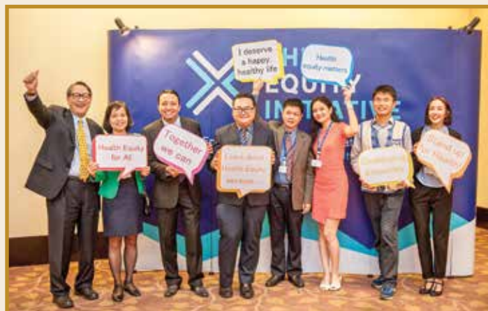
At the launch of the Equity Initiative in 2016, a long-term investment in leadership for health equity in Southeast Asia.