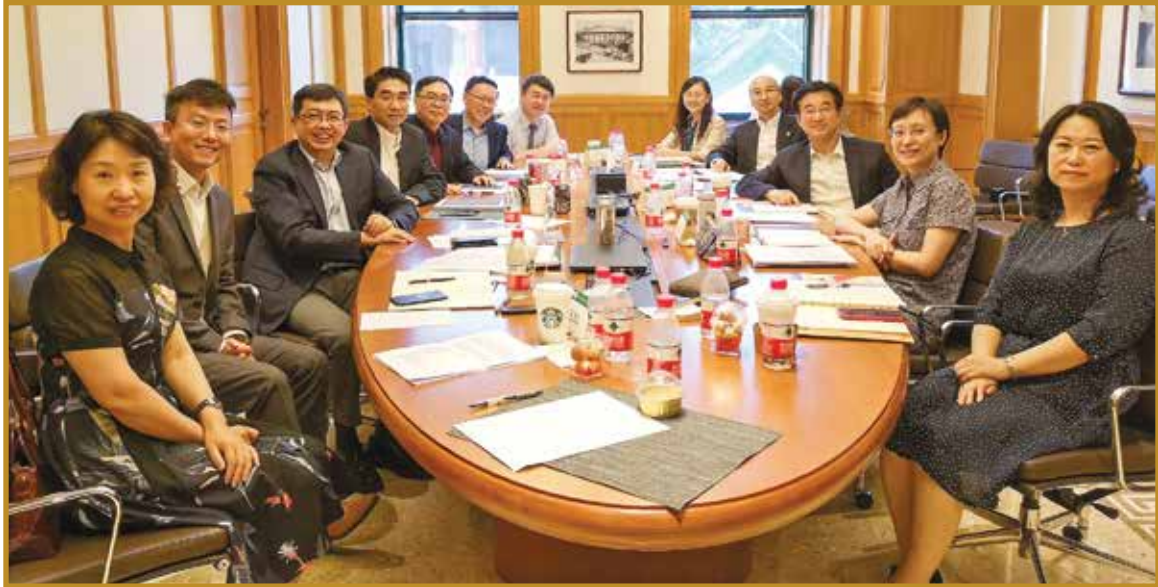
An early discussion about PUMC's 4+4 program was held at the CMB Beijing Office conference room.