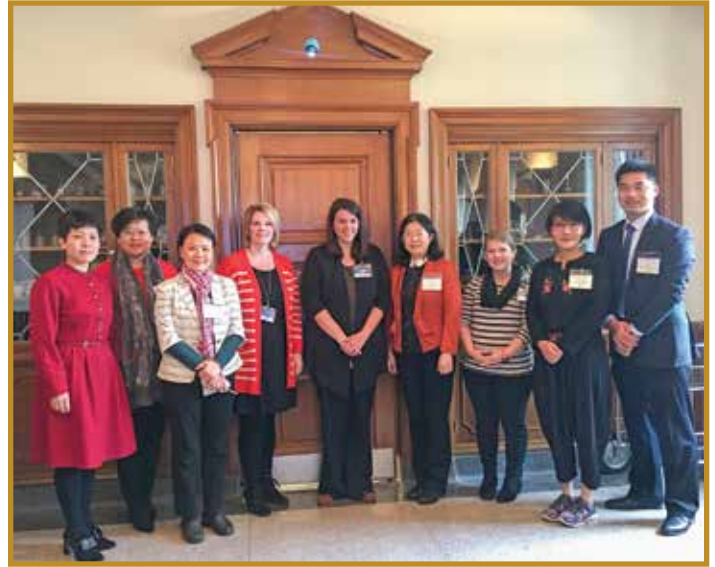
Nursing Consortium representatives shared experiences with specialists at the Mayo Clinic in October 2019.

CMB has played a supporting role in establishing and maintaining a collaborative medical professional community in China. Through such support, it serves as a platform to develop standards on medical education as well as to provide technical consultation to government agencies like the National Health Commission and Ministry of Education and professional organizations like the Chinese Medical Doctor Association. In November