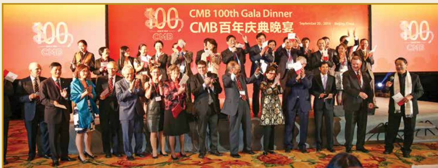
Celebrating CMB's centennial at a gala dinner in Beijing in 2014.