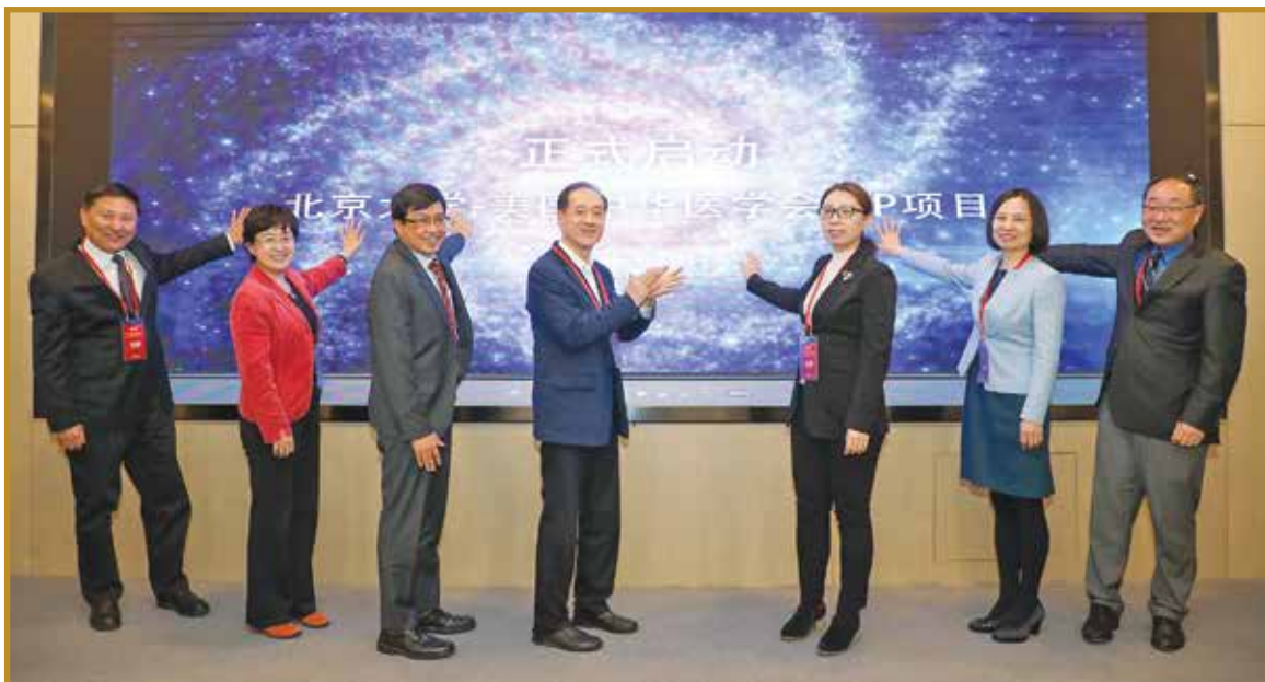
Senior government officials and experts celebrated the launch of a nurse practitioner training program at Peking University Health Science Center.