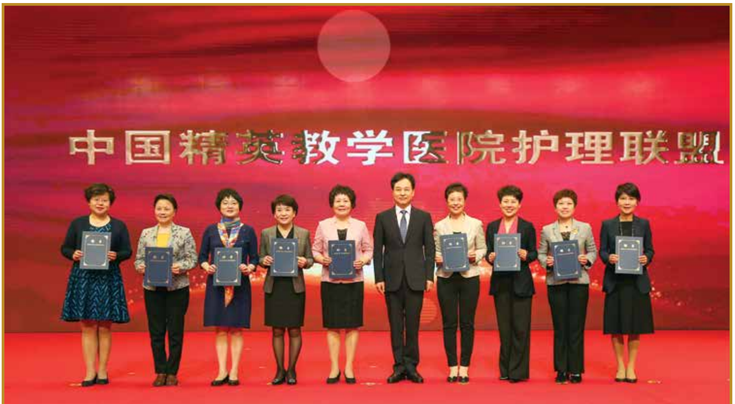
Members of the China Nursing Consortium of Elite Teaching Hospitals at the 2019 launch ceremony.

2019, for example, CMB organized a U.S. study tour for a high-level group of senior Chinese delegates. Site visits to five leading medical schools and discussions with