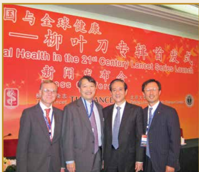
At the launch of The Lancet China Series in 2008. The China series and a later series on health in Southeast Asia became landmark publications.