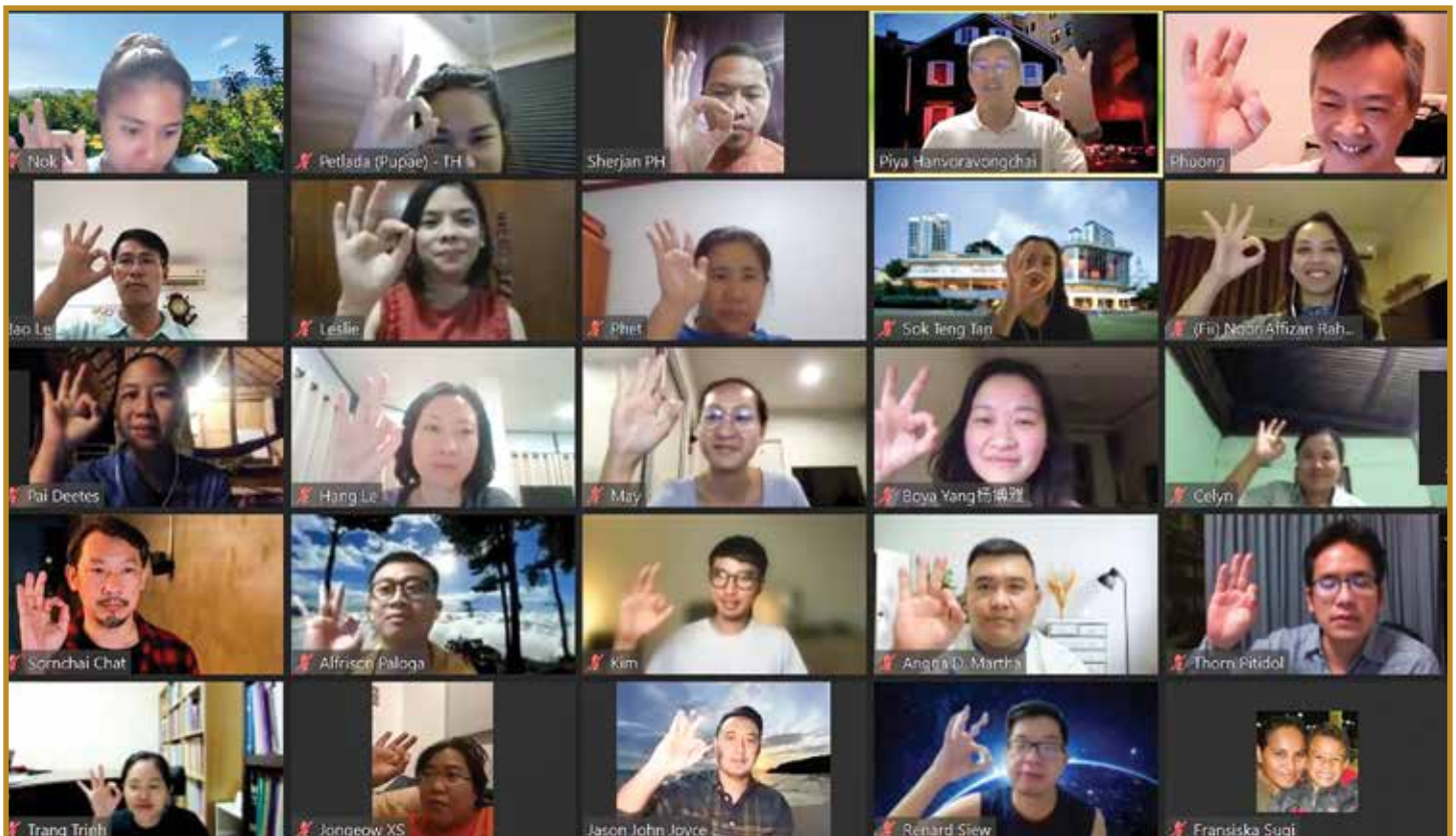
2021 Fellows, pictured here at their March 2021 orientation, began their bonding in the virtual environment.

The long-term goal of the EI is to nurture and support the development of 500 Fellows over the course of 20 years. It is anticipated that Fellows will have a continued and long-term association with the program. The program's greatest value will come from sparking linkages and collaboration among changemakers from a wide range of professions and backgrounds. The CMB Equity Initiative is one of seven interconnected Atlantic Fellows programs, which together form a global community to advance fairer, healthier, and more inclusive societies.