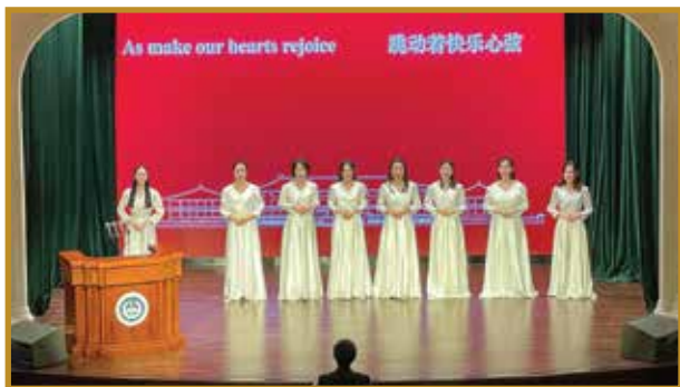
PUMC choir performed the college song at the event celebrating the 100th anniversary of the dedication of PUMC campus.

On September 19, 2021, PUMC marked the 100 th anniversary of the dedication ceremony for its campus, and the Chinese Academy of Medical Sciences (CAMS) celebrated the 65 th anniversary of its founding. In her video remarks, CMB President Barbara Stoll described PUMC as a shining example of the best in medical education. PUMC was the first school in China to offer an eight-year medical school curriculum, and the school's 4+4 program, launched in 2018, is attracting outstanding students with diverse academic backgrounds and preparing them to become superb physicians and medical leaders. President Wang Chen expressed gratitude to the Rockefeller family, for its role in founding PUMC, and early institutional leaders of PUMC.