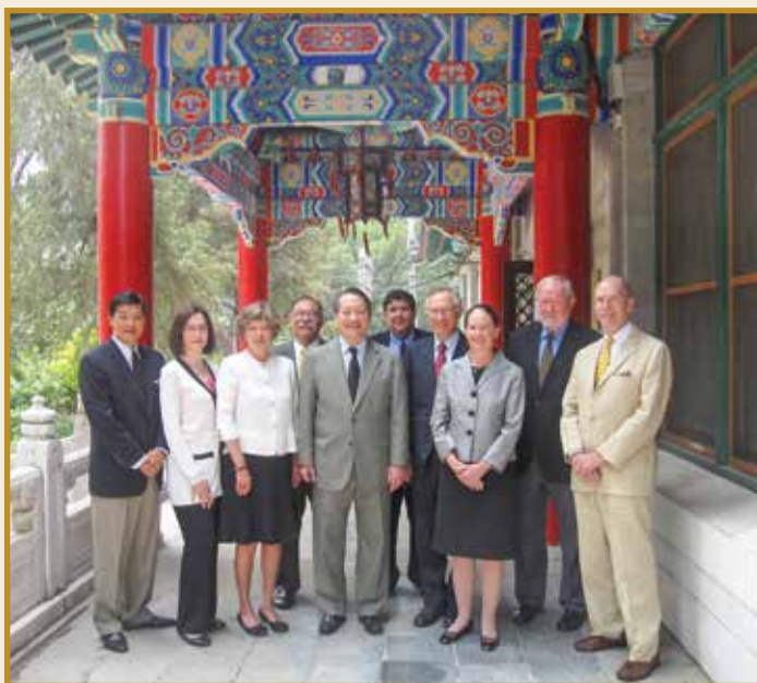
With CMB Trustees, recognizing CMB's heritage with a visit to Peking Union Medical College in 2010.