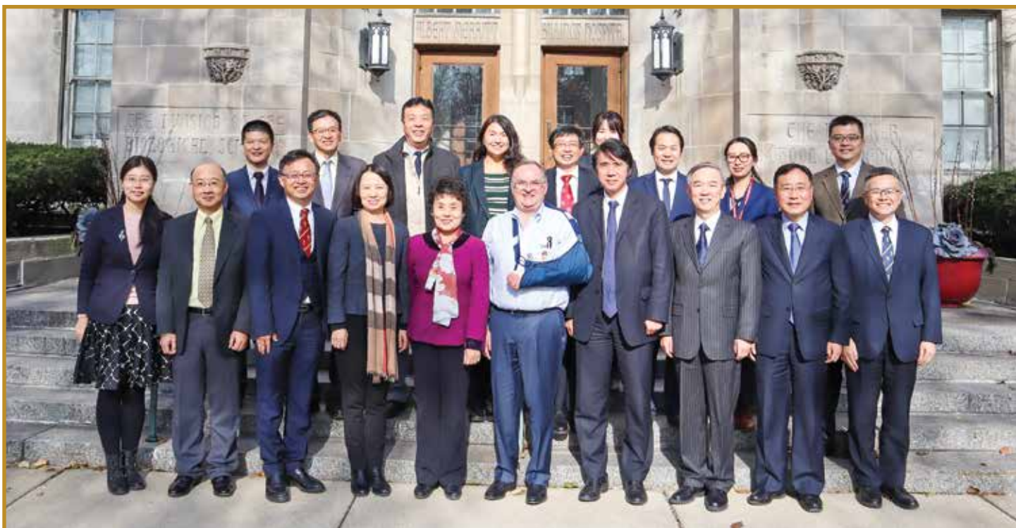
Senior Chinese delegates visited leading American medical schools during a 2019 study tour.

American counterparts introduced the Chinese delegation members to innovative models of medical and clinical education, helping to expand the knowledge base for medical education reform in China. Both the Chinese delegates and the American hosts found great value in such a high-level exchange on medical education. Findings from this study tour contributed to the formulation of policy guidance on “Accelerating the Innovative Development of Medical Education,” which the State Council issued in September 2020.