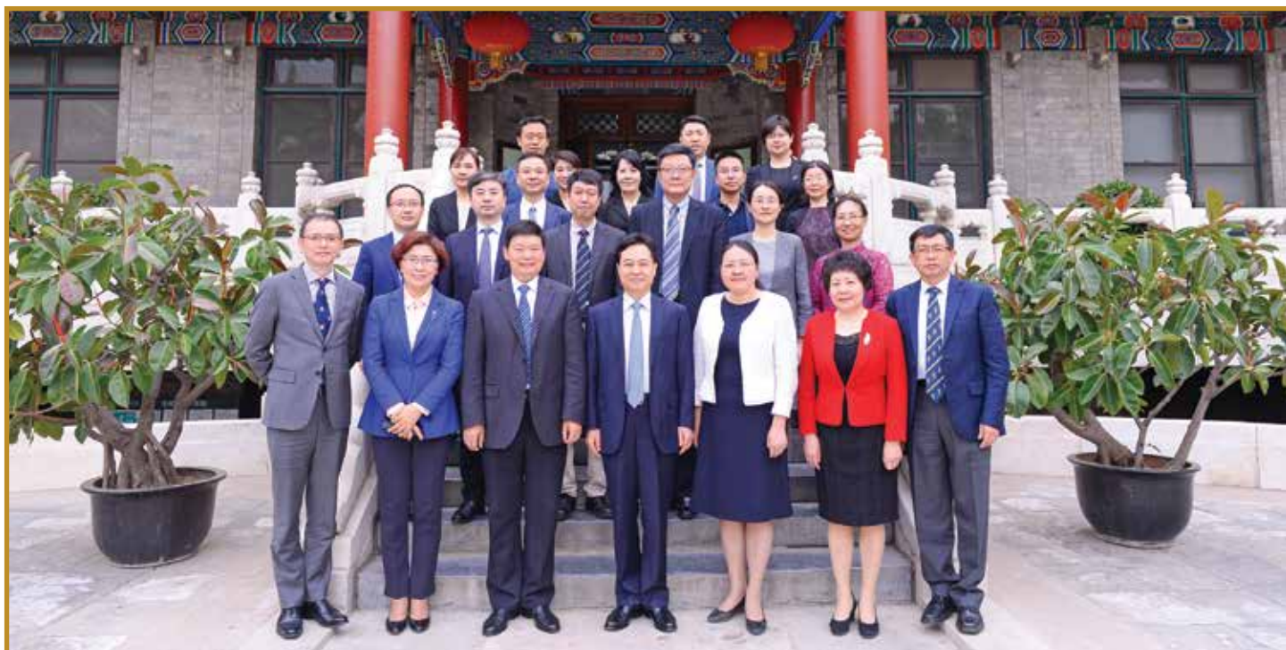
Members of the China Consortium of Elite Teaching Hospitals met in 2019 to discuss progress and next steps.

CMB and Consortium Clinical Education Fellows play an important role in organizing and coordinating the work of the consortium. At the same time, these young physicians — 24 leadership trainees since the consortium's launch in 2015 — have gained a deeper understanding of the principles and practice of medical education and have expanded their professional capabilities. CMB initiated the merit-based Clinical Scholar Innovation Grants Program