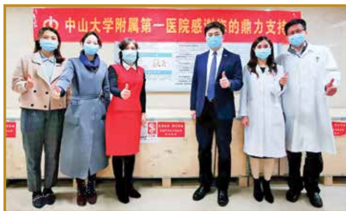
The First-Affiliated Hospital, Sun Yat-sen University expressed appreciation to CMB for the donation of equipment and personal protective equipment.

In early 2020, CMB consulted with Chinese and international partners on a science-based response to reduce threats to health workers and patients. CMB arranged the procurement and donation of air-purifying devices to member hospitals in the CCETH; through a collaborative effort with Shanghai Jiao Tong University, personal protective equipment was donated to CMB's partners in the United States. CMB also supported grants to Peking University Health Science Center and Tsinghua