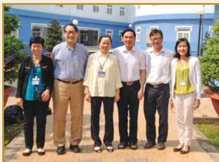
During a 2015 trip to Viet Nam to learn more about plans for medical education reform.