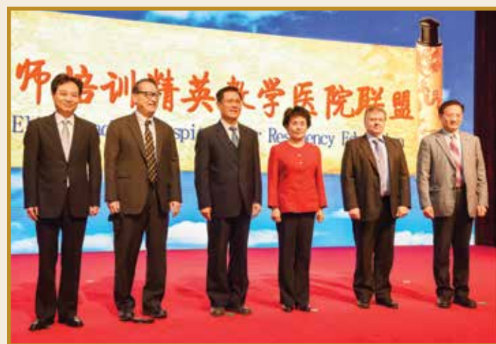
With dignitaries at the 2015 International Conference on Residency Education. Through collaborative relationships, CMB has taken a fresh look at medical education.