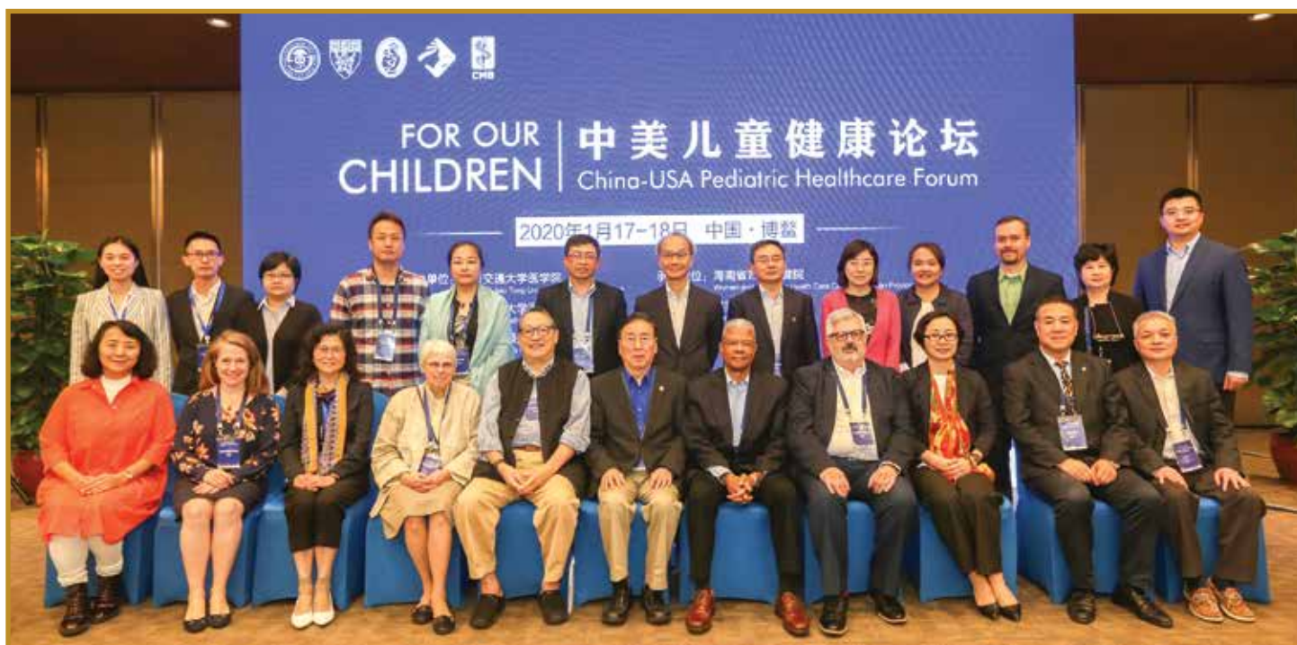
The China-US Pediatric Healthcare Forum, held in January 2020, set the foundation for collaboration on improving child health, enhancing medical education, and refocusing workforce deployment.

One Health is an example of CMB providing support to help seed the development of an emerging field in China, especially timely given the emergence and impact of COVID-19. One Health is a collaborative, multisectoral approach that recognizes that the health of people is closely connected to the health of animals and our shared environment. A CMB grant to Hainan Medical University played a critical role in facilitating