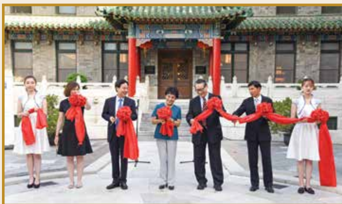
At the opening of CMB's office on the campus of Peking Union Medical College Hospital in 2016, a location that links CMB's past with its contemporary mission.