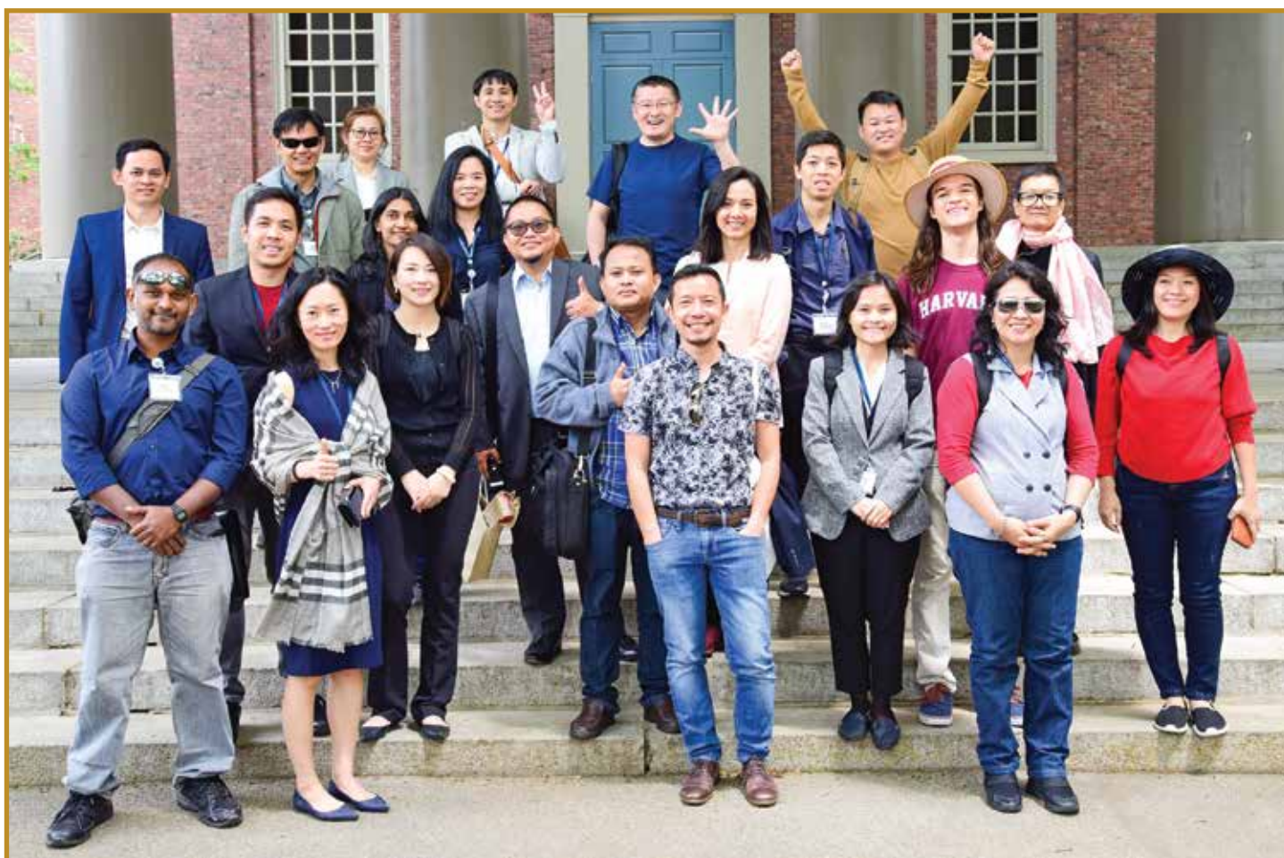
2019 Fellows on the campus of Harvard University in June 2019 as part of their Global Learning experience.

EI's programming rapidly shifted in response to the COVID-19 pandemic and continuing restrictions on travel. Induction year programs for Fellows selected to participate in the 2020 cohort were postponed, and outreach to Senior Fellows, who were affected by and responding to the pandemic, was increased. Over the course of 2020, EI staff worked diligently to revise first-year activities for the virtual environment. They welcomed a new cohort in 2021 with expanded content for the EI online learning platform, opportunities to engage with leaders through online exchanges, individual coaching sessions, and support for Fellows' well-being. In-person programming is slated to resume in 2022, as conditions allow, with travel and experiential learning opportunities extended to 2020/2021 Fellows, as well as to the incoming 2022 cohort.