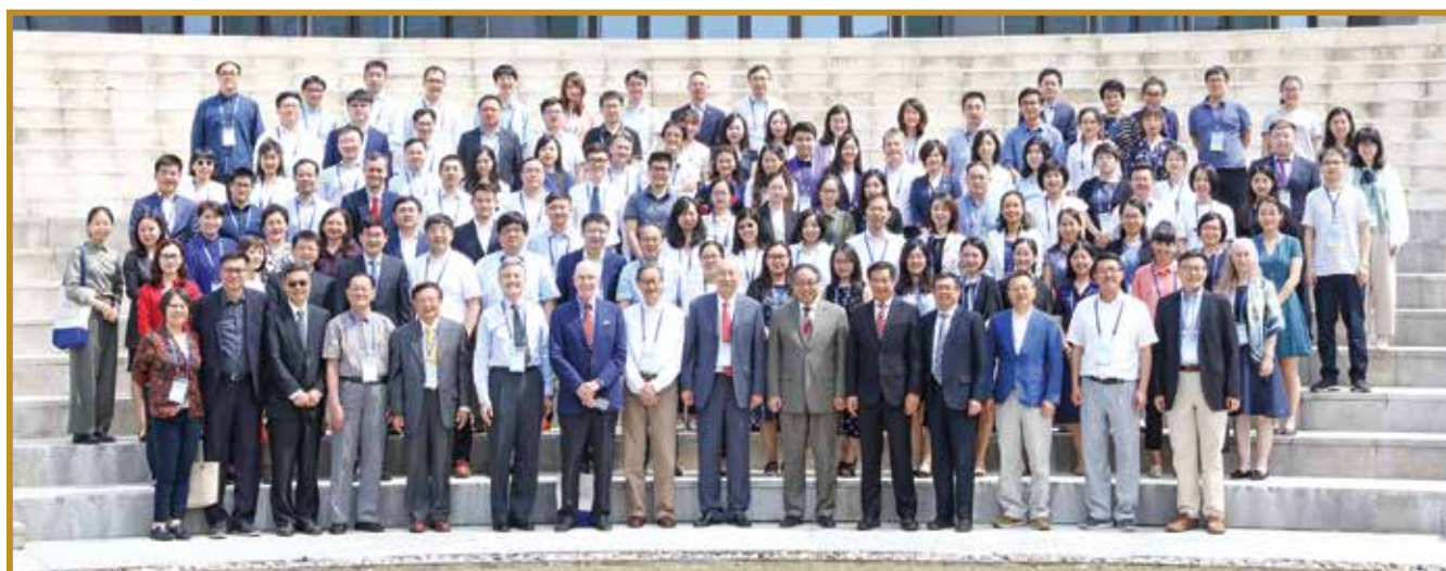
In June 2019, CMB convened the Westlake Youth Forum with Zhejiang University School of Medicine, bringing together over 120 young health policy and systems researchers to meet together and continue to build a vibrant community for future collaborations.

with more than $13 million in funding. Interest in this program has grown significantly over time. With a focus on capacity building, the OC encourages multidisciplinary projects, especially collaboration between public health and clinical medicine, as well as collaborative links to international scholars. CMB considers the OC to be a leadership development program, providing early and mid-career professionals with funding to develop their own research projects in the context of a strong research community. OC themes of recent years included maternal and child health, quality of care, health technology assessment, and primary health care.